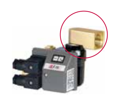
KAPTIV-MD-AL equipped with side inlet adapter