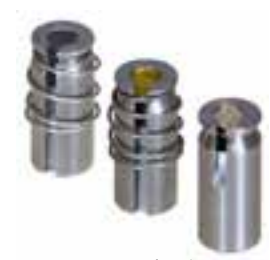
Various seal options