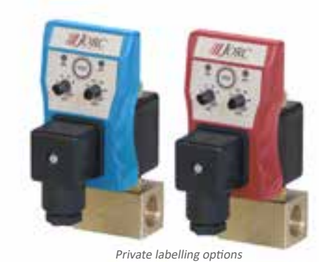
and various colors available